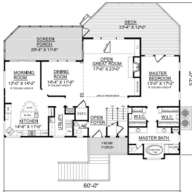
FIRST FLOOR PLAN Plan No.