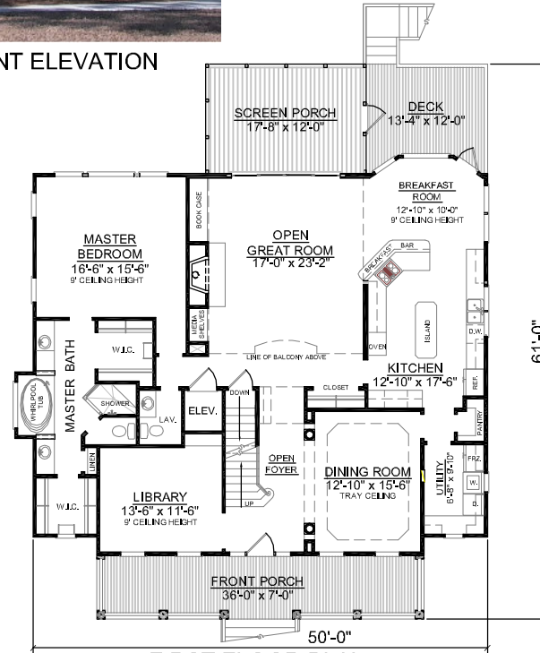
FIRST FLOOR PLAN Plan No.