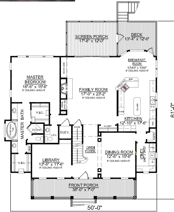
FIRST FLOOR PLAN Plan No.